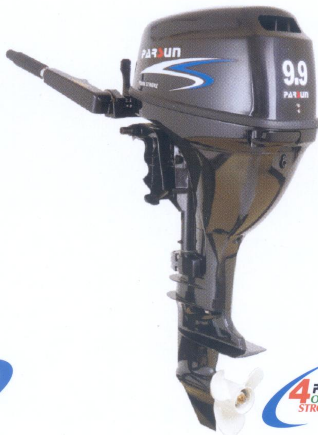
PAR SUN F-9.9BMS