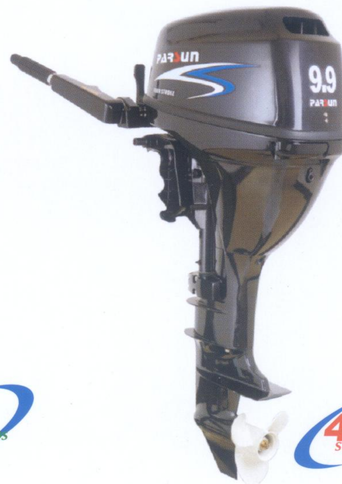
PAR SUN F-9.9BML