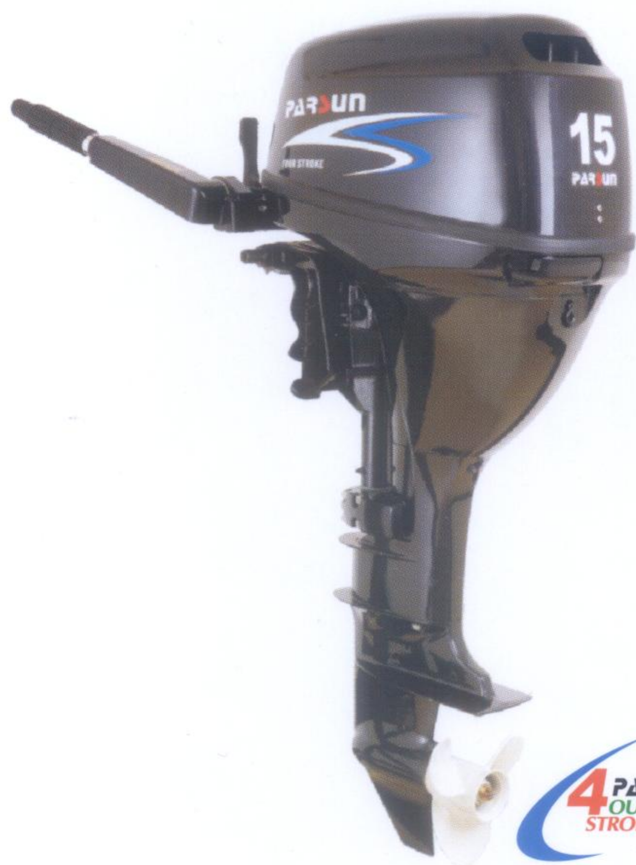
PAR SUN F-15BML